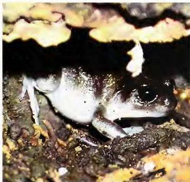
Fig. 6. Callulops cf. dubius from Salibabu Island.

Morphology & Taxonomy: Characteristically short-snouted, small frogs with short limbs: SVL 23.0–39.6 mm, TiL 9.5–15.5 mm; dorsally uniform dark brown to gray-